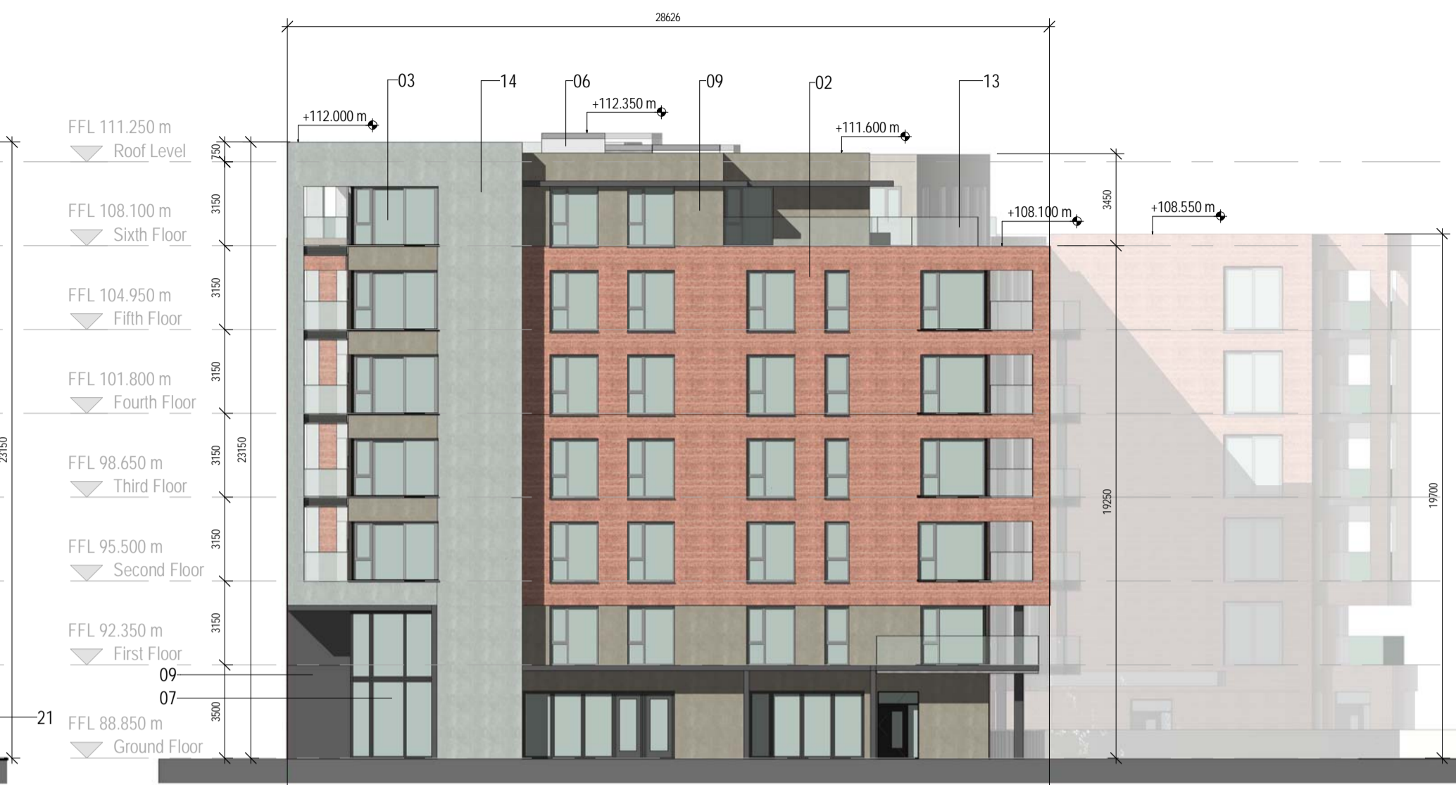
02 - North Elevation 1 : 200