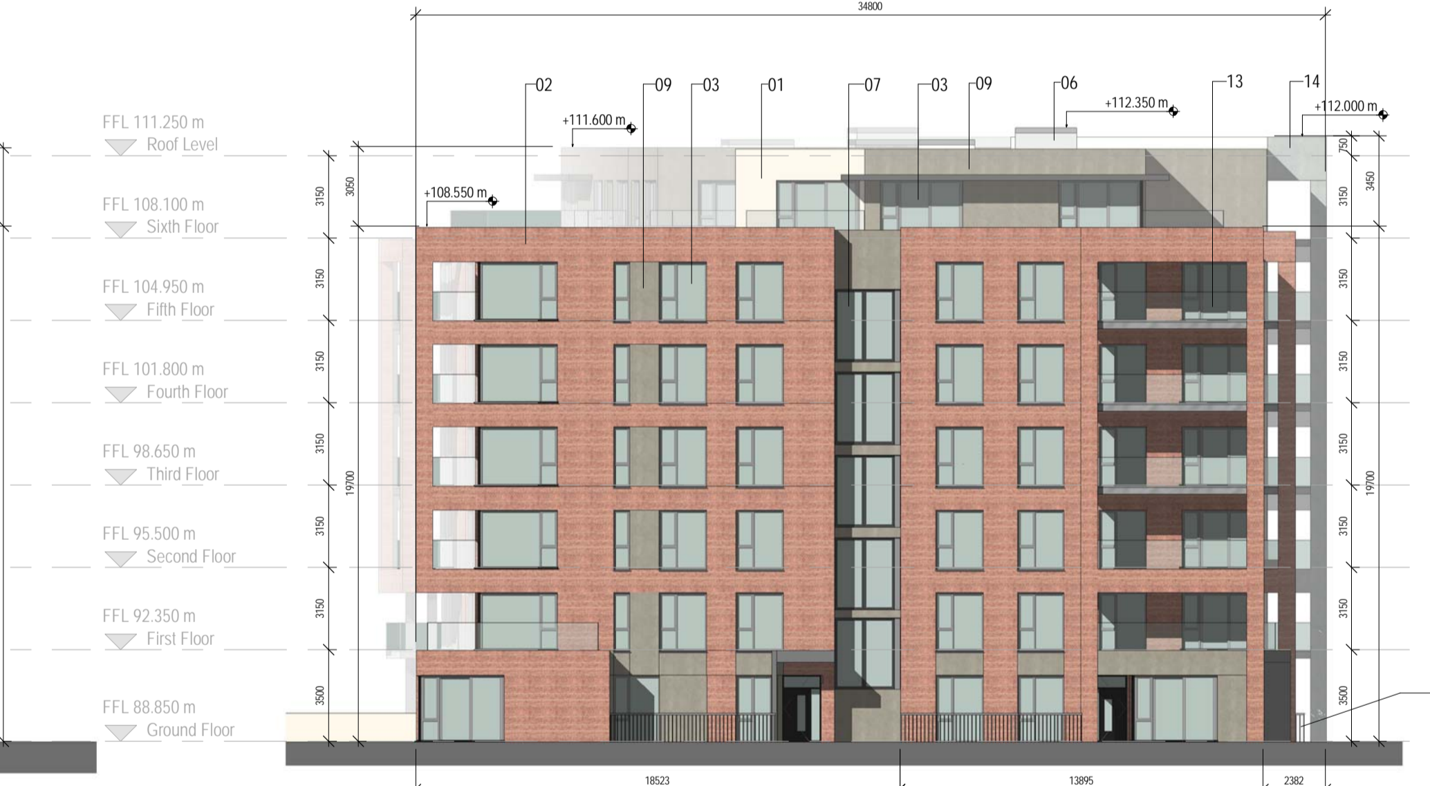
03 - South Elevation 1 : 200