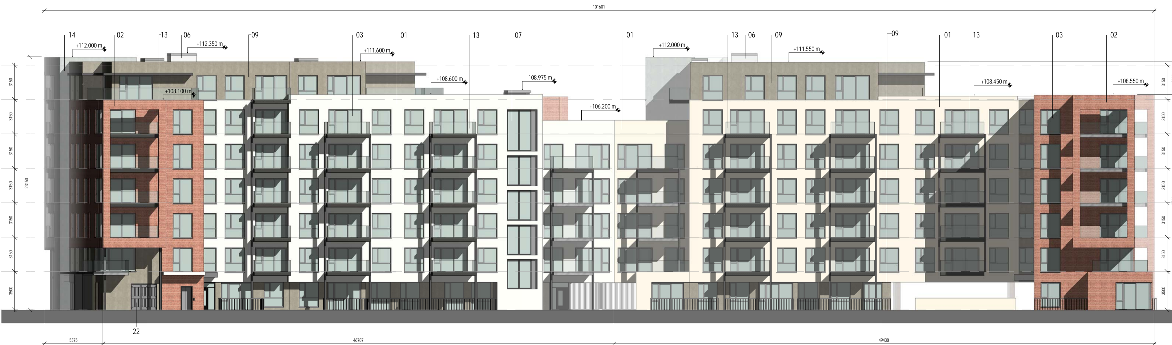
04 - West Elevation 1 : 200