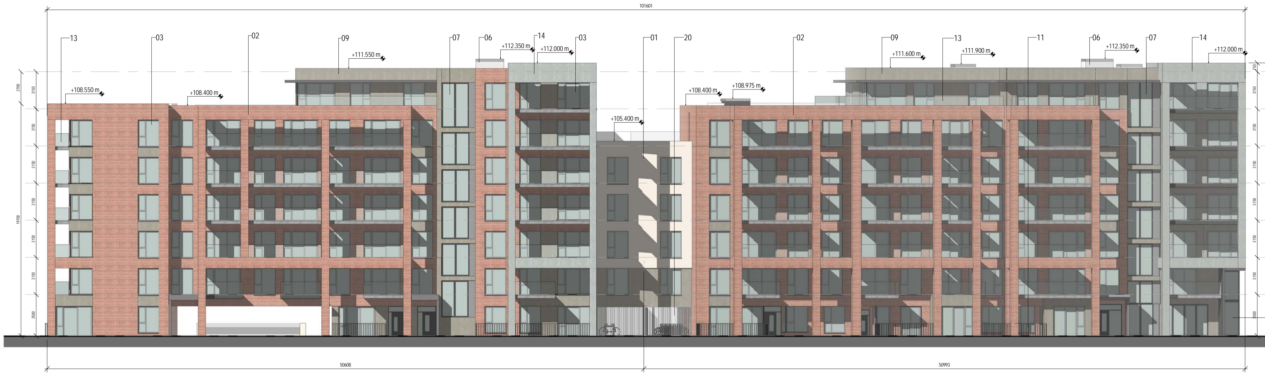
01 - East Elevation 1 : 200

ALL DIMENSIONS ARE TO BE CONFIRMED ON SITE DIMENSIONS ARE NOT TO BE SCALED FROM THIS DRAWING THIS DRAWING IS TO BE READ IN CONJUNCTION WITH CONSULTANTS DRAWINGS ALL WORK TO BE CARRIED OUT IN ACCORDANCE WITH CURRENT BUILDING REGULATIONS